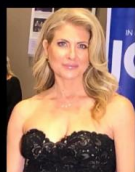
FEATURING EMMY® AWARD WINNER TARA BERNIE